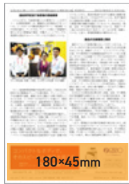
RISO KAGAKU CORPORATION Nov. 2016 (Singapore-Edition)